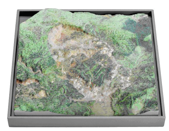
Topographic 3D model of the Iwate-Miyagi Inland Earthquake