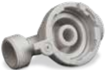
Hose fitting printed in DuraForm ProX GF