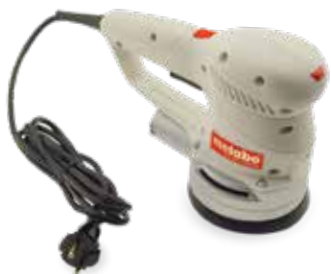
Sander tool housing printed in DuraForm PA material