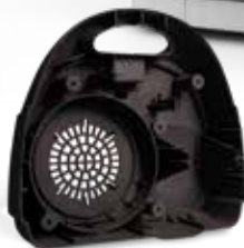
Back cover of vacuum cleaner printed in DuraForm EX Black