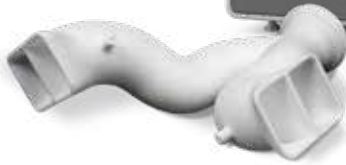
Manifold printed in DuraForm ProX FR1200