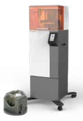
Figure 4 Standalone is an affordable and versatile solution for low volume production, and fast prototyping in the tens and hundreds of parts per month. Figure 4 Standalone offers quality and accuracy with industrial-grade durability, service and support.

Affordable industrial-grade solution for lower cost production parts