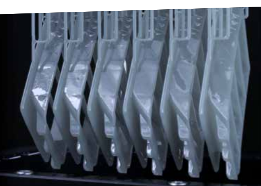
Figure 4<sup>™</sup> delivers ultra-fast additive manufacturing technology in discrete cells, allowing it to be placed into automated assembly lines and integrated with secondary processes, including washing, drying and curing.