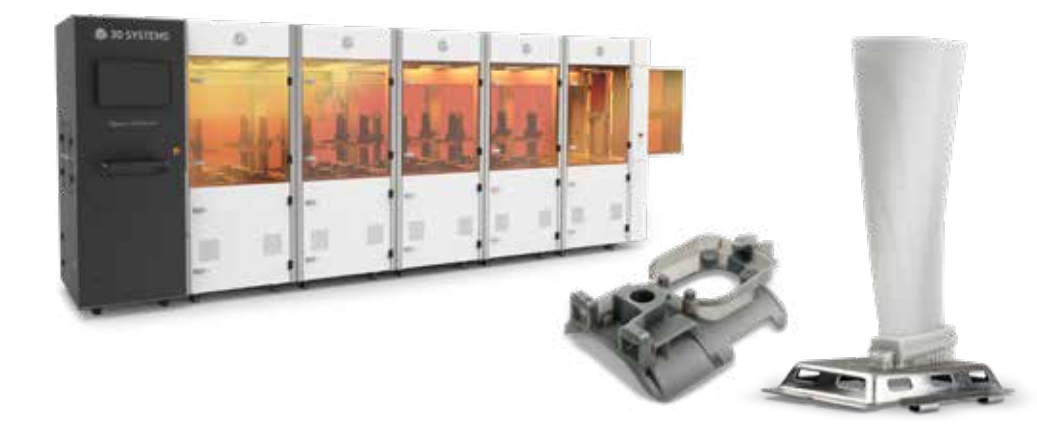
Figure 4 Production packages the design flexibility of additive manufacturing in configurable, in-line production modules to deliver a customizable and automated direct 3D production solution. Features like automated material delivery and integrated post-processing reduce hands-on processes to streamline operations and lower total ownership costs.