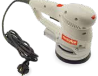
Sander tool housing printed in DuraForm PA material

3D Systems sPro SLS systems share a common architecture to produce high-resolution, durable thermoplastic parts available in medium to large build volumes.