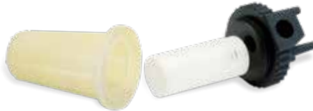
Functional filter prototype printed in clear, white and black rigid plastics

Part accuracy and material performances perfectly suit rapid tooling applications