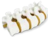
Print realistic medical models in rigid and elastomeric materials