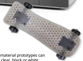
Multi-material prototypes can blend clear, black or white to communicate ideas and simulate finished products